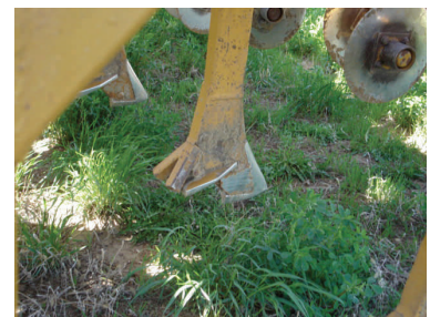
NO TILL DRILL

Please call the Conservation District Office for more information at 557-2740 x 100